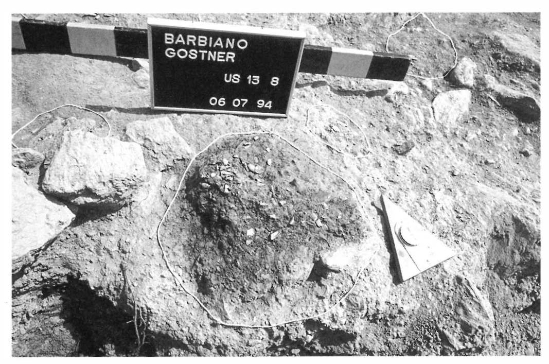
Fig. 4 - Detailed view of grave pit n.3/8