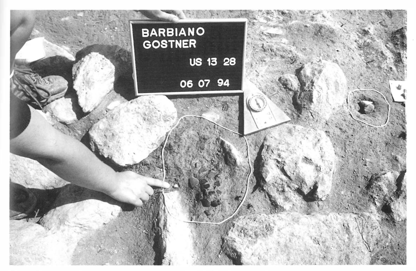
Fig. 2 - The aspects of some of the grave pits found still including their contents